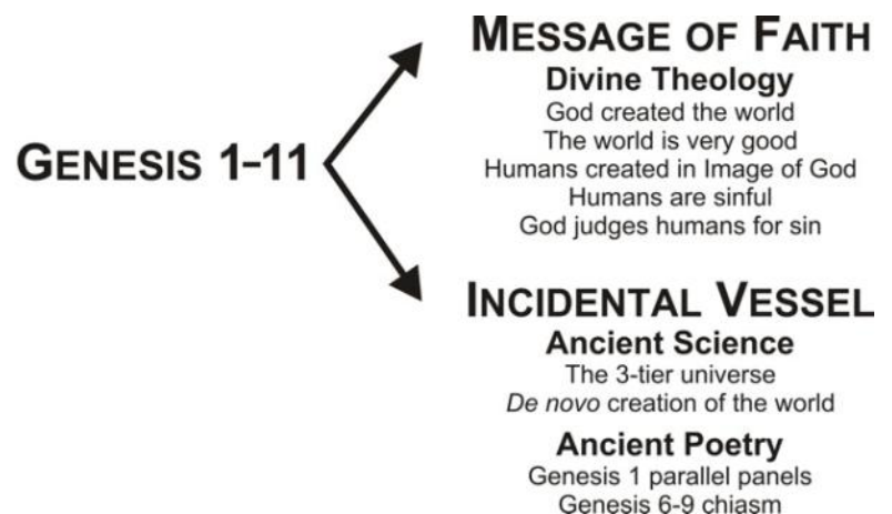
Figure 5. Genesis 1-11 and the Message-Incident Principle.

Regrettably, English Bibles do not translate fully the original Greek. “Under the earth” should be rendered “the underworld” [see Figure 1]. In fact, the Greek word katachthonion in this verse refers to the beings down ( kata ) in the chthonic ( chthonios ) or subterranean realm (cf., Matt 12:40; Eph 4:9–10; 1 Pet 3:19). Nevertheless, the Message of Faith in this passage is clear—Jesus is Lord of the entire creation. And Paul delivers this inerrant spiritual truth by using the incidental science-of-the-day—the 3-tier universe. Similarly, in the opening chapters of Genesis, we must separate the eternal Messages from the incidental vessels as presented in Figure 5 .